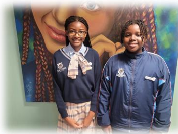
Deputy Head Girl and Boy