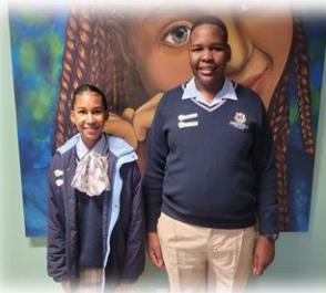
Head Girl and Boy